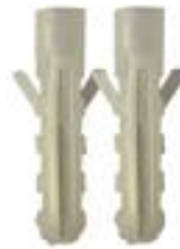
Wall mount kit