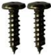
Wall mount kit