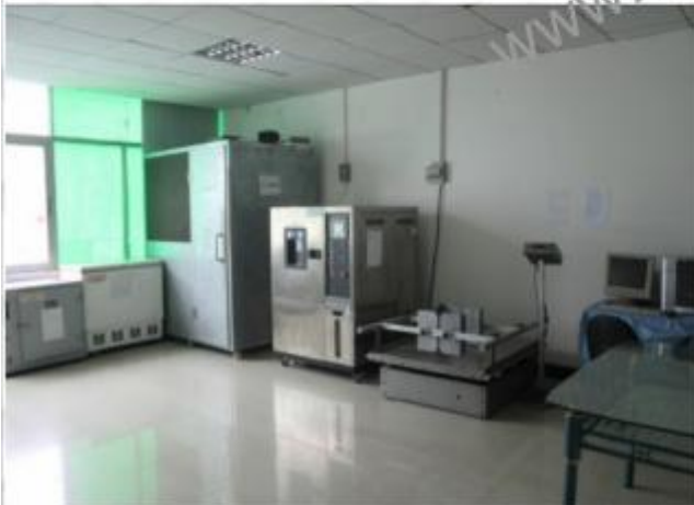
Product Testing Machines