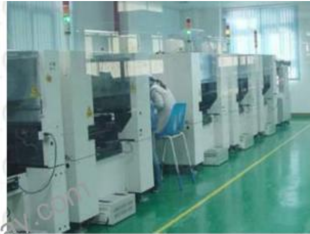
High-speed SMT Device