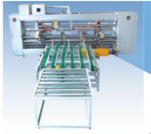
DOUBLE HEADS STITCHER