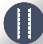
Dual Array Silicon Photonics Diode sensor