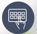
7in color touch screen