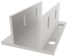
Carport Structure Bottom Base