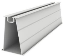
Carport Structure Rail