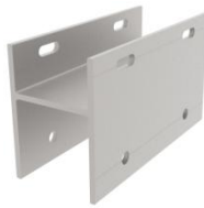
Carport Structure H Beam Connector 1#