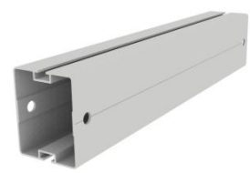
Carport Structure Pole