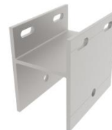
Carport Structure H Beam Connector 2#