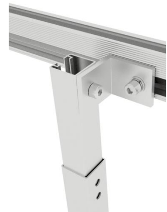
Connect to rail