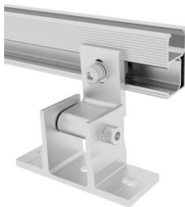
Connect to rail