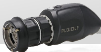
3CCD HDTV camera head, format 16:9

Maximum color fidelity and precise detail, e.g. for laparoscopy