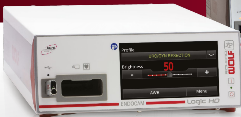
ENDOCAM Logic HD