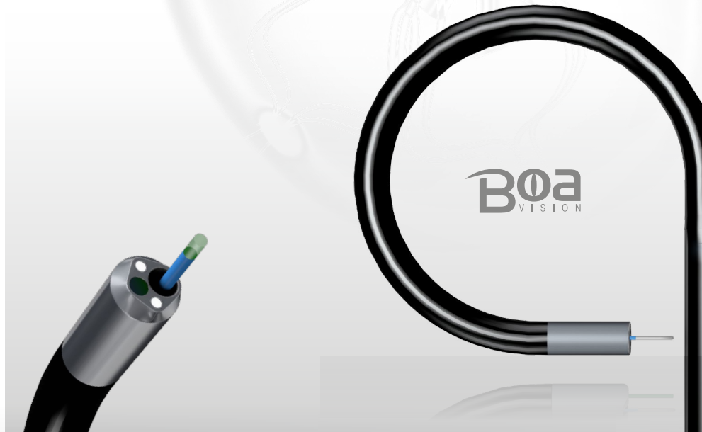
270° deflection in both directions with inserted auxiliary instrument ...