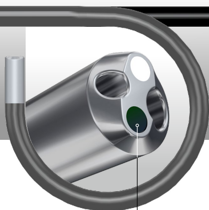
Image sensor at the tip of the instrument

Its unique small diameter makes BOA vision ideal for all urological treatments. As the only flexible dual channel Sensor URS available in the marketplace, COBRA vision is particularly recommended for stone therapy. If the two instruments are used together in clinical application, they meet the requirement of the urologist for universal application options and a specification based on high-performance technology.