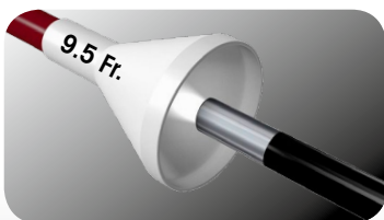
Suitable for 9.5 Fr. Access Sheath