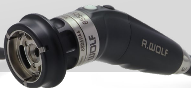
1CCD HDTV camera head, format 16:10

Maximum color fidelity and precise detail, e.g. for laparoscopy