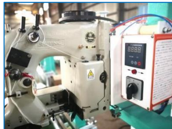
Auto cutting sewing machine