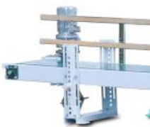
Bolt lifting conveyor