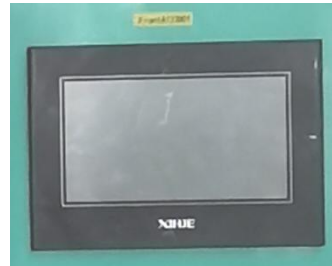
Touch screen indicator