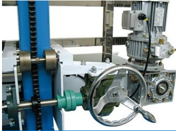
Motor lifting conveyor