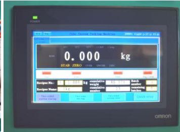
Omron Touch screen