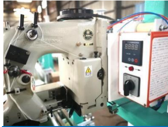
Auto oiling sewing machine