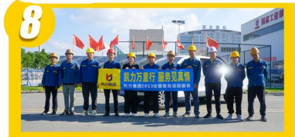
8 24小时全天候售后服务团队, 业内知名, 有口皆碑。Our 24-hour after-sales service team is well-known in the industry and has a good reputation.