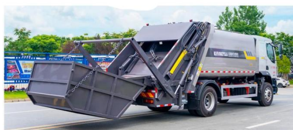
摆臂垃圾斗 Swinging arm garbage bin