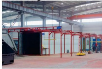
喷粉车间 Powder spraying workshop