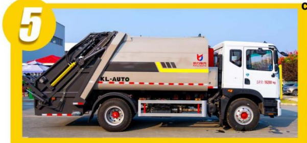
5 质量过硬, 物超所值, 超大容积、外置油缸、最高压缩比, 买到即赚到 Excellent quality, value for money, super large volume, external oil cylinder, highest compression ratio, earning money immediately upon purchase