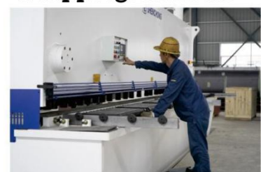
数控折弯机 CNC bending