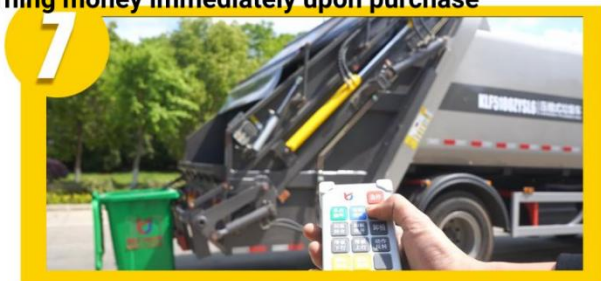
7 电控系统与国外技术团队合作研发, CAN总线控制, 相对于老款PLC更智能, 搭配光电感应系统, 标配遥控器, 性能更稳定, 使用更方便 The electronic control system is developed in cooperation with foreign technical teams, with CAN bus control, which is more intelligent than the old PLC. It is equipped with a photoelectric induction system and a standard remote control, resulting in more stable performance and more convenient use