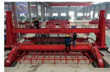
智能包罐机 Intelligent can wrapping machine