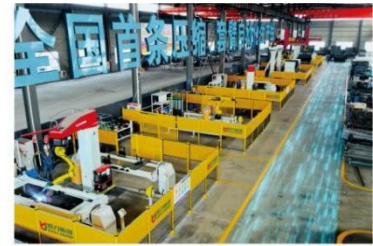
压缩自动化生产线 Compression automation production line