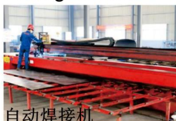
自动焊接机 automatic welding machine