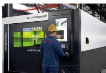
光纤激光切割机 Fiber laser cutting machine