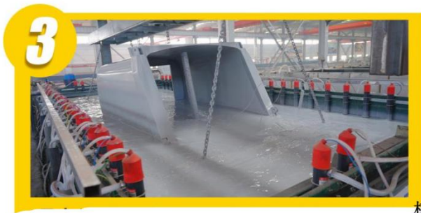
3 顶尖涂装工艺, 上装电泳选择, 防腐防锈十年无忧 Top coating technology, top electrophoresis selection, worry free anti-corrosion and rust prevention for ten years