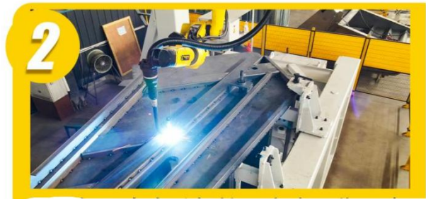
2 智能机器人自动焊接, 安全可靠、密封性好 Intelligent robot automatic welding, safe and reliable, with good sealing performance