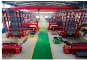
标准化制罐线 Standardized can making line