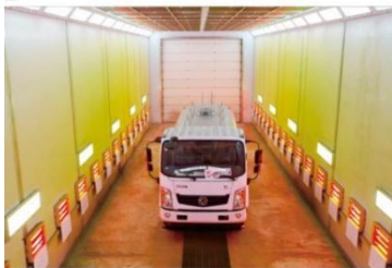
烘烤一体房 Baking integrated room