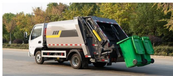
挂桶翻转 Hanging bucket flipping