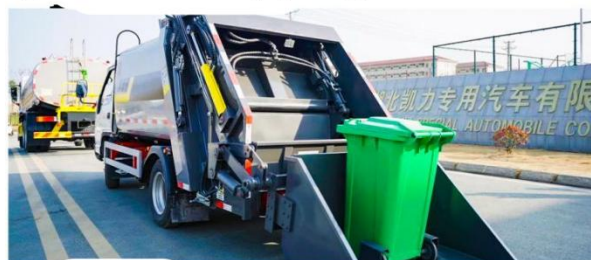
三角斗 Triangle bucket