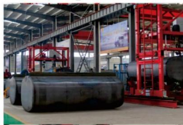
环缝自动焊 automatic welding of circumferential seams