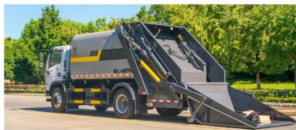
大落地斗 Large floor bucket