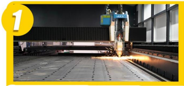
1 数控激光切割, 工装精度保证 CNC laser cutting, ensuring tooling accuracy;