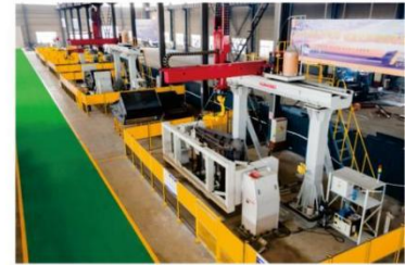
智能机器人车间 Intelligent robot workshop