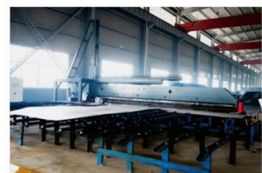
四轴卷板机 Four axis rolling machine