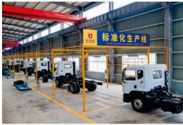
洒水车标准化生产线 Standardized production line for sprinkler trucks