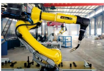
自动焊接机器人 Automatic welding robot