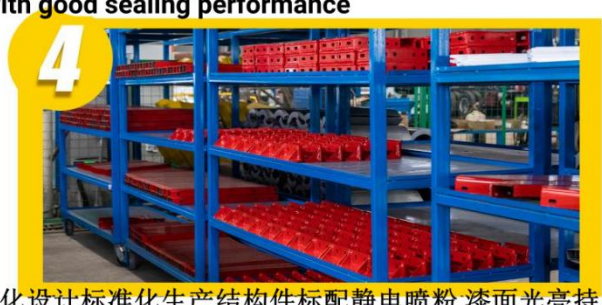
4 模块化设计标准化生产结构件标配静电喷粉, 漆面光亮持久, 防潮防腐, 持久耐用; Modular design, standardized production of structural components, equipped with electrostatic powder spraying as standard, the paint surface is bright and long-lasting, moisture-proof and corrosion-resistant, and durable;