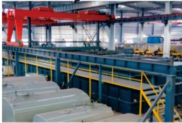
电泳生产线 Electrophoresis production line