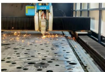
激光切割机 Laser cutting machine