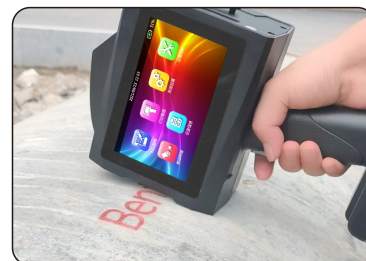
Portable Printer For Indoor And Outdoor Use