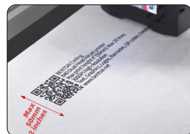
Inkjet Coding Machine For Large Characters