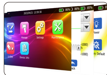
User-friendly 5" HD touchscreen, intuitive software.