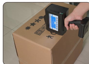
Support Fonts And Image Import