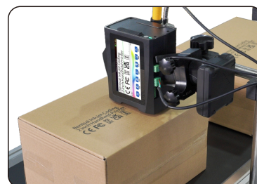
Inline Conveyor Coding Option