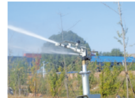
Original SIMA spray gun from Italy