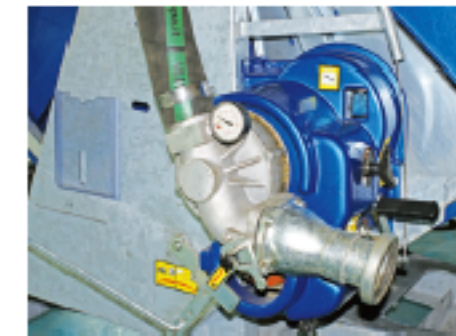
integrative water turbine and gearbox