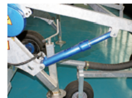
hydraulic lifting system