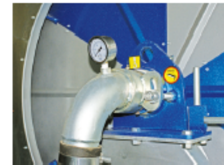
integrative water inlet structure more durably