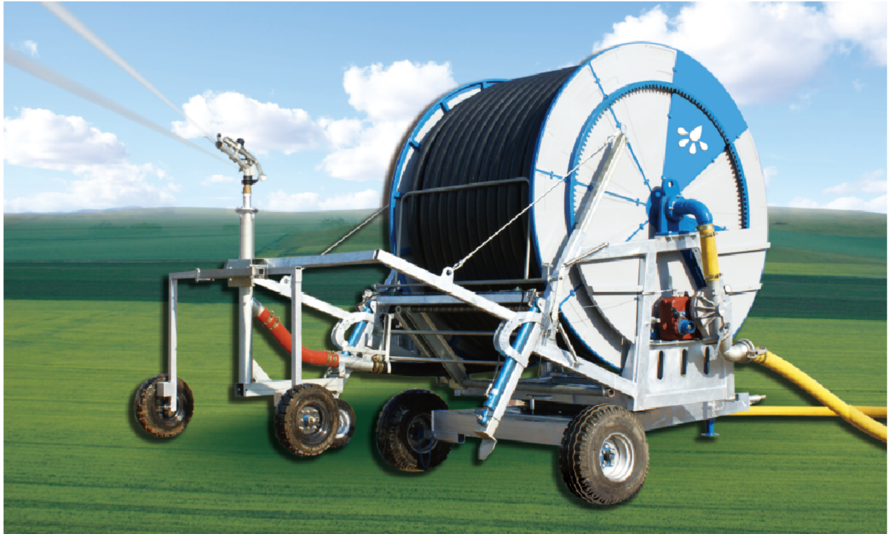
JP Hose Reel Irrigation Machine