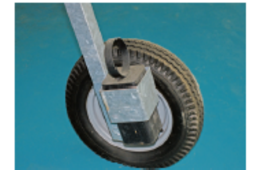
new balance weight structure