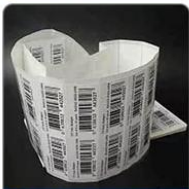
Barcode Shipping Stickers