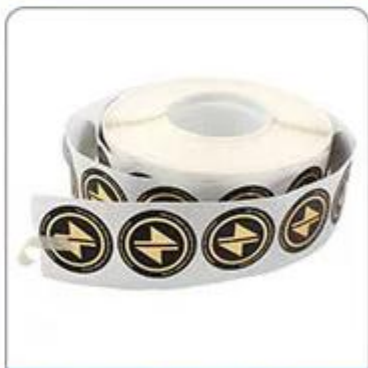
Gold Foil Round Roll Sticker