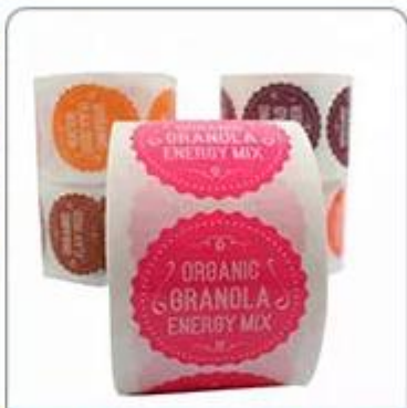
Adhesive Roll Stickers