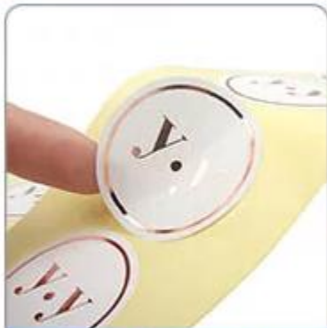
Rose Gold Paper Stickers