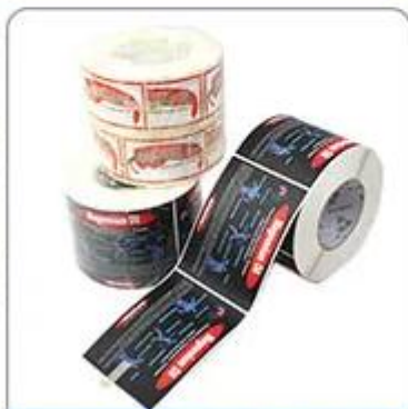
Roll Logo Sticker