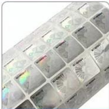
3D Holographic Stickers