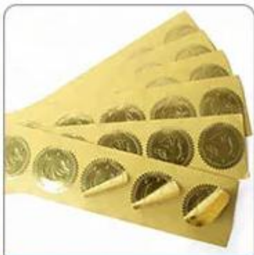
Gold Foil Adhesive Stickers