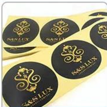
Shiny Gold Foil Stickers