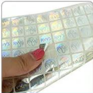
Hologram Anti-counterfeit Stickers