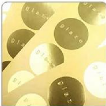
Round Gold Foil Stickers