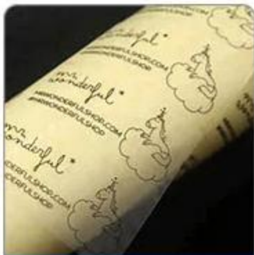
PVC Plastic Stickers