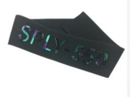
3D Silicone Logo Design