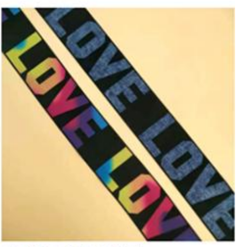
Silicone Anti-slip Style