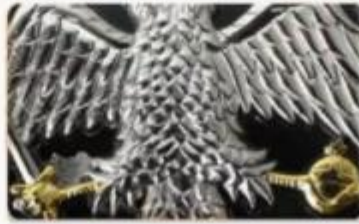
BRIGHT GOLD BRIGHT NICKEL