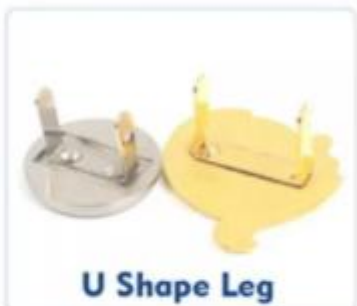
U Shape Leg