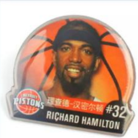
Offset Printing + Epoxy