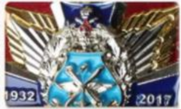
MATTE SILVER BRIGHT GOLD