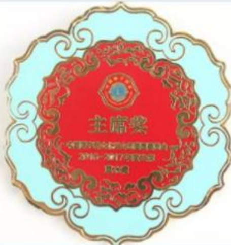
Imitation Hard Enamel