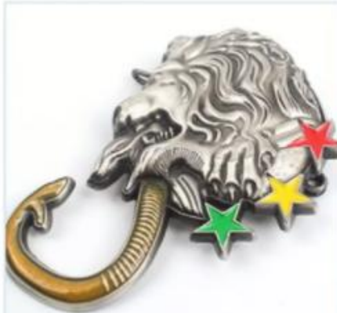
Die Casting Badge