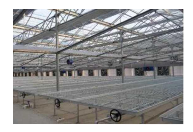
Manual Rolling Bench