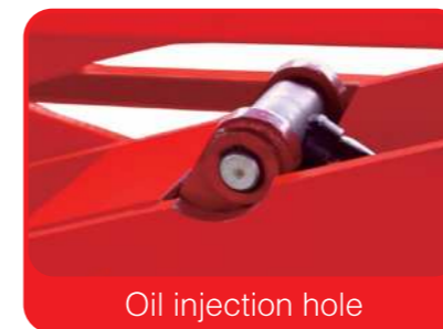
Oil injection hole