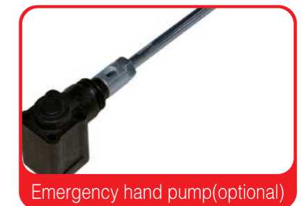
Emergency hand pump(optional)