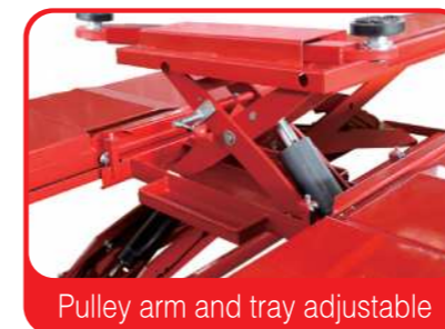
Pulley arm and tray adjustable