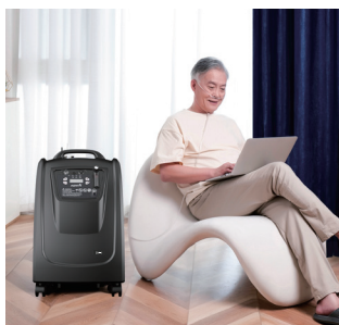
FOR HOME USE