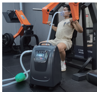
FOR SPORTS CENTER/GYM