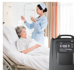
FOR HEALTHCARE CENTER AND MEDICAL PURPOSE