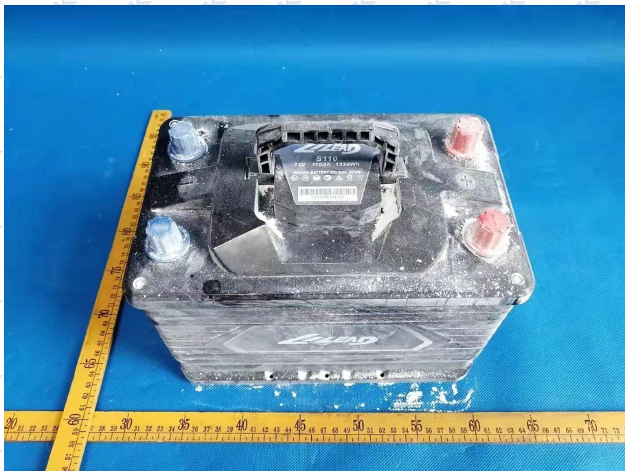
Photo 4 -- After test