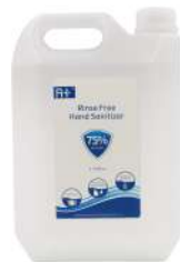
3785ml (1 gallon)