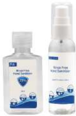
59ml / 60ml