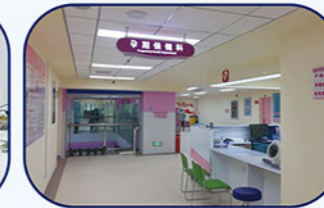
Maternity and child hospitals