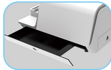
Liquid waste drawer