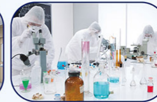
Scientific research institutions