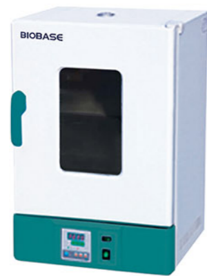
BOV-V30F/ BOV-V45F/ BOV-V65F/ BOV-V125F