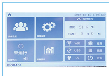
LCD touch screen