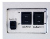
LAN Port Access