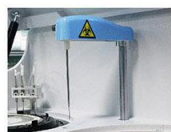
Sample Needle Liquid level sensor function. Anti-collision function. Reagent volume real-time detection.