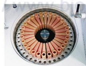
Reagent Tray Refrigerated tray with independent switch.