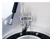
Washing Probe Independent 3 -step washing system.