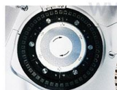
Reaction Tray 37±0.2°C, real-time monitor.