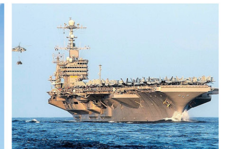
Naval & Marine