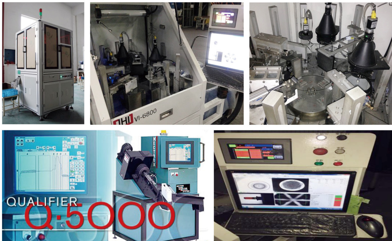
360° display sorting Tray mode: chuck, glass plate, strip.