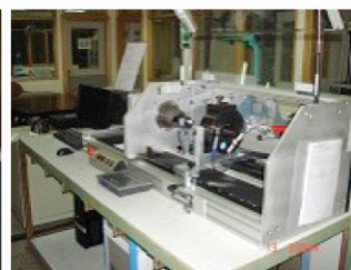
FRICTION COEFFICIENT ANALYZER