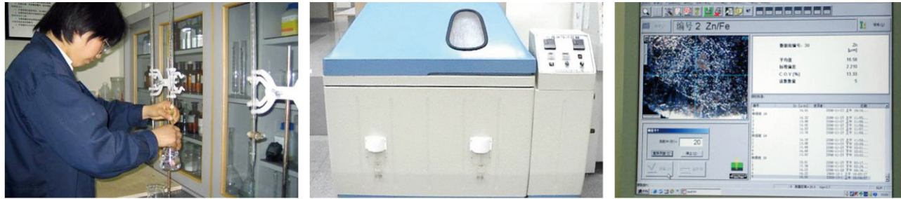
Chemical examination analysis