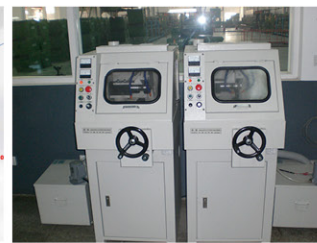
ABRASIVE CUTTING MACHINE