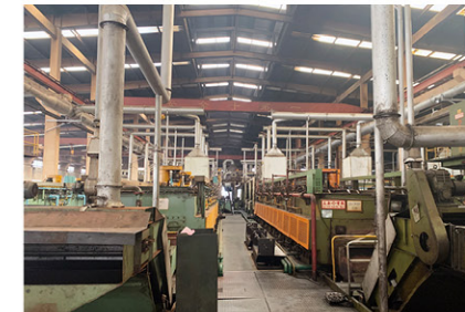
Production grade : 8.8-12.9