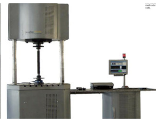
FATIGUE TEST MACHINE ROUGHNESS TEST CLEANLINESS TEST