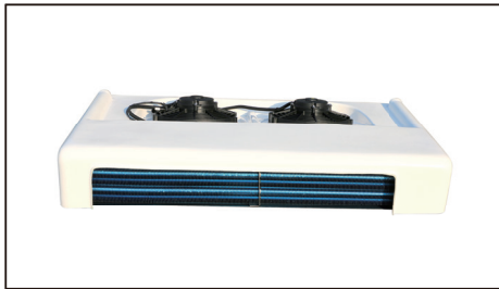
C300F / C350F Evaporator