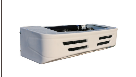
C150F / C300F Condenser