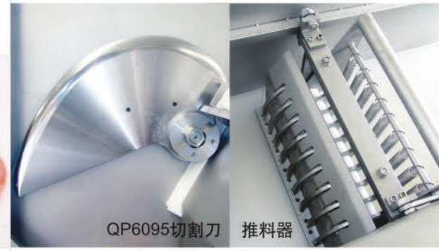
QP6095切割刀 Cutting Knife 推料器 Pusher

QP6590切片机适用于肉类、三文治火腿、香肠、奶酪、鱼等产品的切片。切片速度200time/min。 安装砍排刀可切割排骨(不包括腿骨等过硬的骨头)。 推进器自动返回定位,节省时间,提高效率。 刀片直接与驱动电机连接,发挥了电机的使用效率,大大提高切割、分份的精确度。