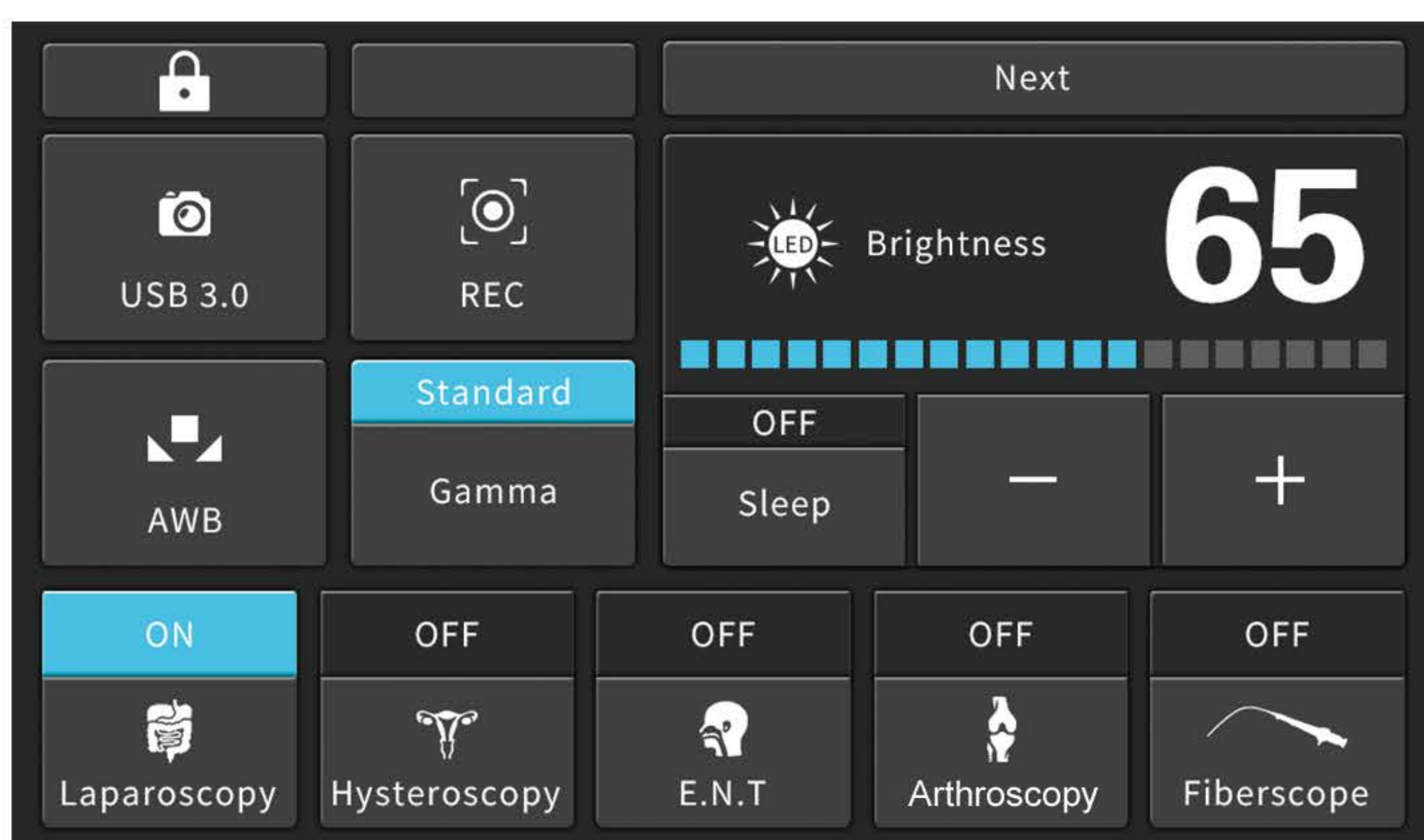
Main page 1