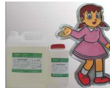
Clear Dome Epoxy Resin AB Glue for 3D Stickers