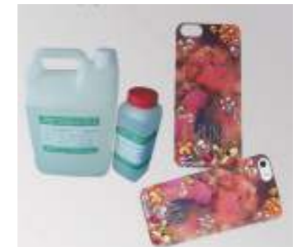
Clear Dome Epoxy Resin AB Glue for Mobile Phone Case Stickers