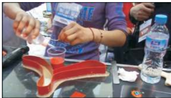
Add the hardener (B) into the Epoxy resin (A) with colors