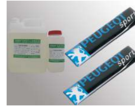
Clear Dome Epoxy Resin AB Glue for Car Logo Stickers