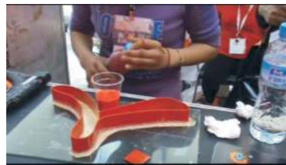
Mix the Epoxy resin(A) with Colors you like,then pour into a cup