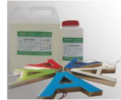
Clear Dome Epoxy Resin AB Glue for Car LED Letters