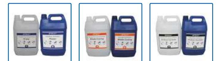
MTB-3327 Epoxy Primer MTB-3328 Epoxy Middle Coat MTB-3329 Epoxy Top Coat